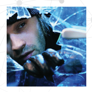
ACE 300 Series laminates provide the best resistance in the industry against burglaries and forced-entry attacks.

The use of Improvised Explosive Devices (IEDs) has become a primary weapon of terrorists in their efforts to generate fear, publicity and political instability.